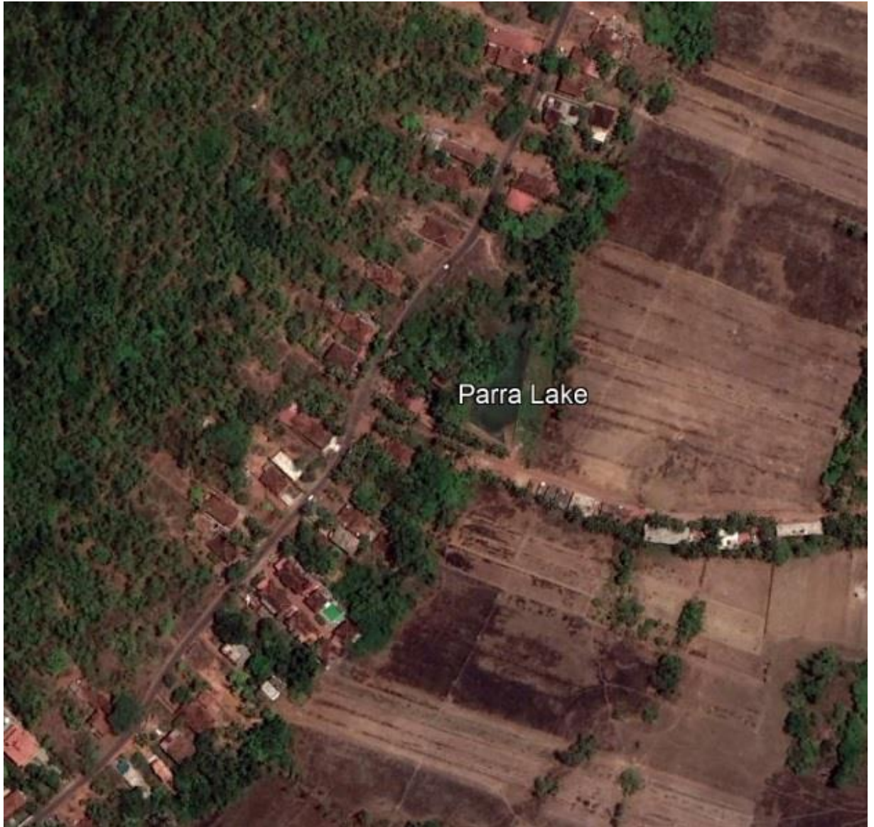
Annexure-IV: Google image of Parra Lake